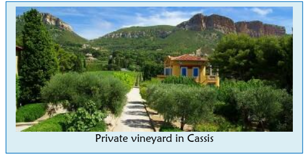
Private vineyard in Cassis

Enjoy the morning at the vibrant market in Aix, one of the best in the region. Late morning we'll leave for Cassis to enjoy a wine tasting at a private vineyard of select white Cassis wines in a drop-dead gorgeous location on the Mediterranean Sea. Lunch at a superb restaurant with a dazzling view. Take a boat ride to the breathtaking "Calanques" this afternoon or spend leisure time strolling the port before returning to Aix late afternoon.