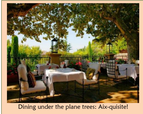
Dining under the plane trees: Aix-quisite!