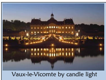
Vaux-le-Vicomte by candle light

and to honor the king, threw an enormous inauguration party with fireworks, music, theatre, and food. Louis, raging with jealousy that Fouquet had outdone him, had him arrested the following day and imprisoned for the rest of his life. Fouquet never saw his chateau again and died in prison 30 years later. The chateau of Vaux le Vicomte hosts a stunning candlelight tour every Saturday evening. Arrive at the chateau around 5 pm, wander the magnificent gardens, dine at the chateau in the early evening, then do the candlelight tour of the interior of the chateau. Return to Paris by 11 pm. DINNER