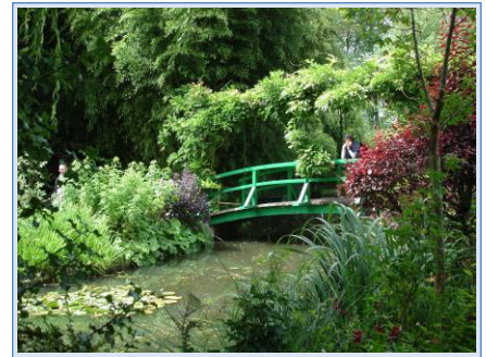
Giverny : Magnificent gardens. spectacular scenery

Back to the future: although not chronologically "Belle Epoque", this magnificent château southeast of Paris is breathtakingly beautiful and historically fascinating. Relax all day in Paris, see the sights you haven't yet seen, go on private visits, shop in the Marais, etc...then leave Paris this afternoon and head to the incredible chateau of Vaux le Vicomte, the forerunner of the Château of Versailles. In 1661, Nicolas Fouquet, then Louis XIV's finance minister, built this incredible chateau for himself,