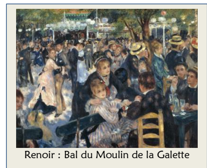
Renoir : Bal du Moulin de la Galette