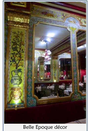
Belle Époque décor