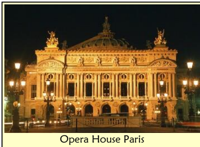
Opera House Paris