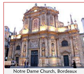
Notre Dame Church, Bordeaux